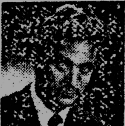
JEAN COUTU — French Canada's leading star of TV, stage and radio.