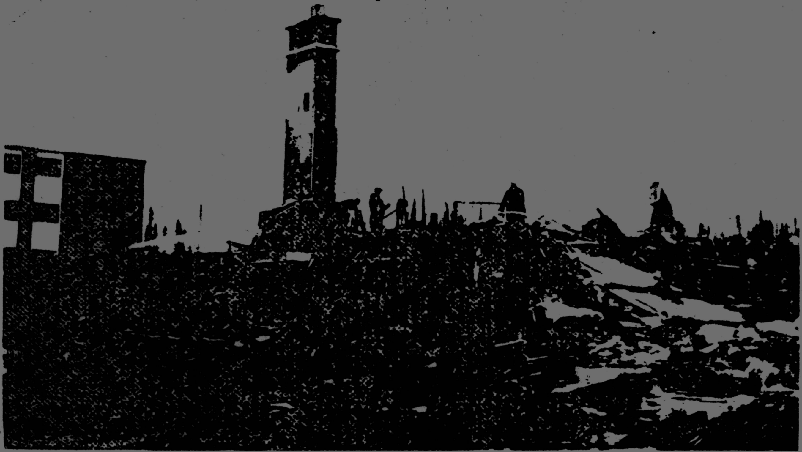
Pictured above is all that remains of a twenty-three unit apartment building after it was destroyed by fire on Saturday, November 28th.

Note: The comments and opinions expressed in this paper are not necessarily those of the publisher.