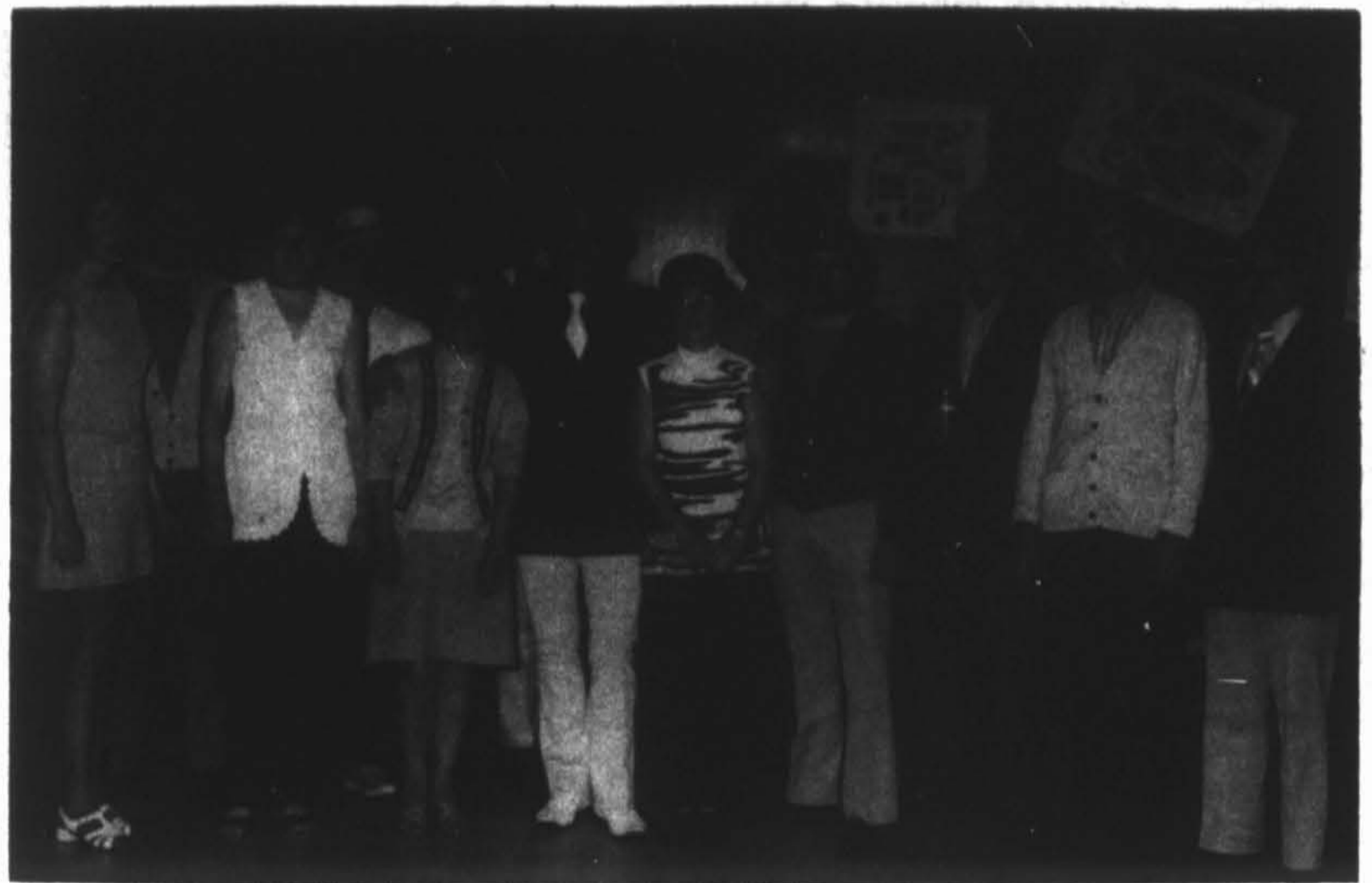
Prize winners of the recent Labatt's Golf play at Tamarack.

NEWFOUNDLAND LOAN: The Province of Newfoundland has a European debt issue in the works dominated in West German marks. The planned 8 per cent debenture issue, to mature in 1936, is for 80 million marks, equivalent to about $23.5-million at today's exchange rate for Canadian dollars. European reports suggest an issue price of $98.25.