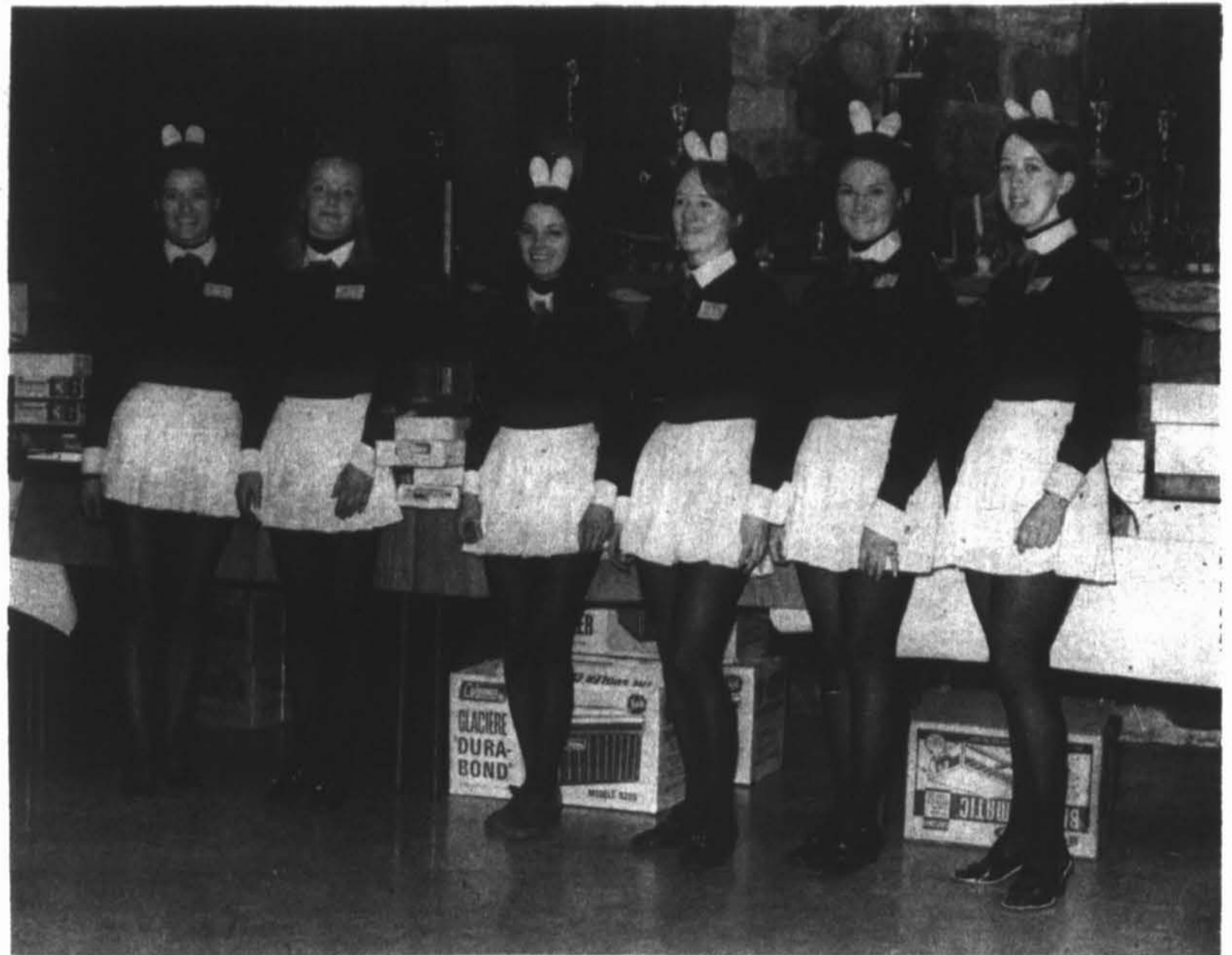
Carol Curling Club "Playmates" pictured during the recent Invitational Bonspeil.