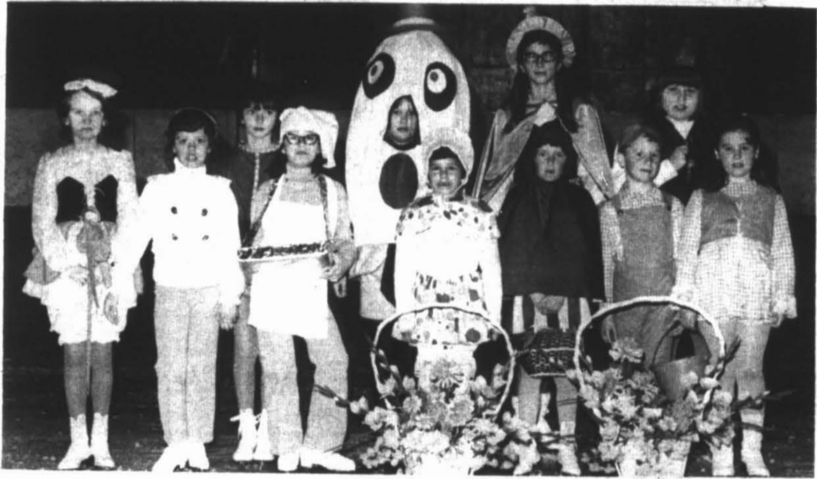
Scenes from the annual review "Polaris on Parade" performed by the Polaris Figure Skating Club.