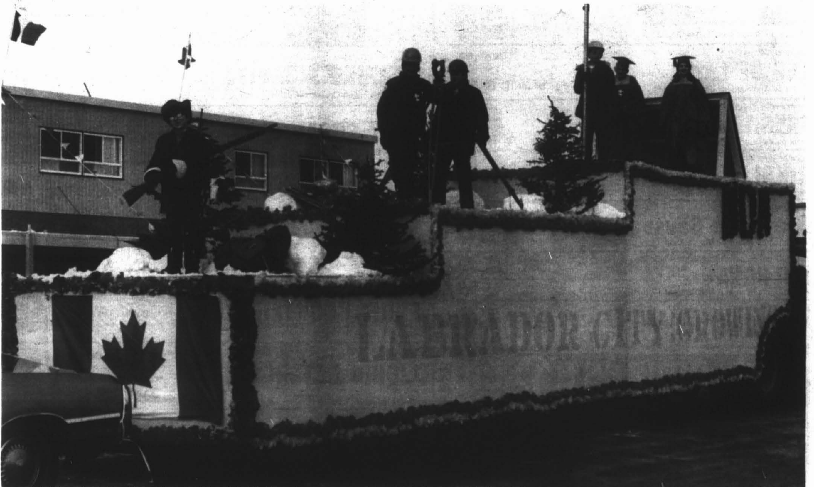
1st. Prize, Float Winners. A repeat for Notre Dame Academy.