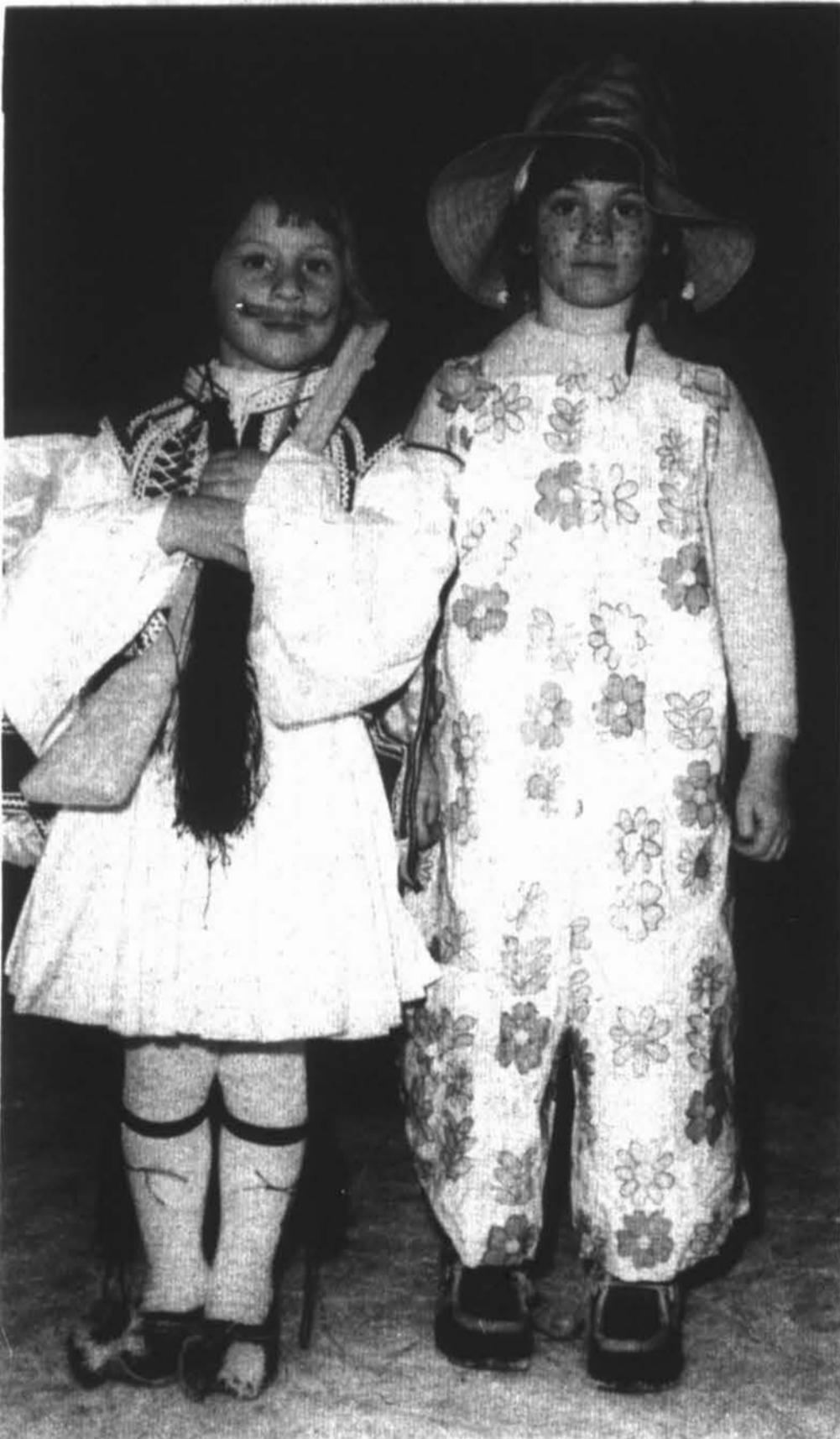
Two Winners of the Carnival Masquerade ON ICE Contest.