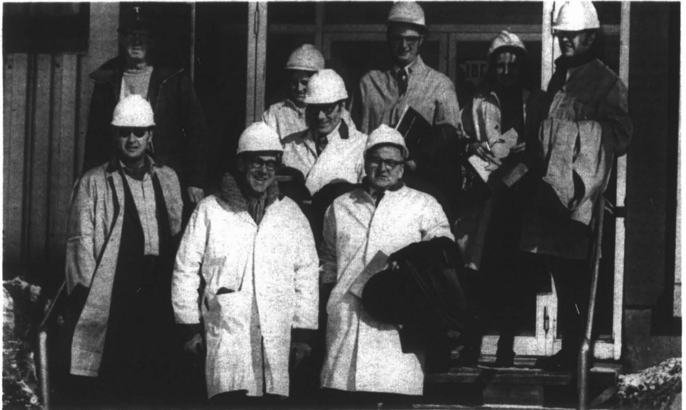
TOUR INDUSTRY — Hon. R.L. Stanfield (center) and visitors during tour of Iron Ore Company facilities, on 13 March.

A significant change in the age of customers visiting the sales counter at the American Bible Society in Los Angeles is reported by the staff there — and the same observation would hold true for the Canadian Bible Society, especially in Vancouver where a youth corner has been set up in the Society's Book Store. They are now getting a heavy influx of young people in the 18 to 25 year-old bracket. They are typical of their generation, and many are dressed in hippie fashion, but the significant thing is that they are buying Scriptures not only for their own personal use but to give to other young people. Many of them show evidence of knowing the Scriptures, particularly the New Testament, quite well. They show something of a sense of desperation in that they have not been able to find answers to questions in some of the movements in which they have been involved and some of the philosophies which have to be turning to the Scriptures with a desperate hope and some real expectation that here they will find answers to their problems and to the problems of Society.