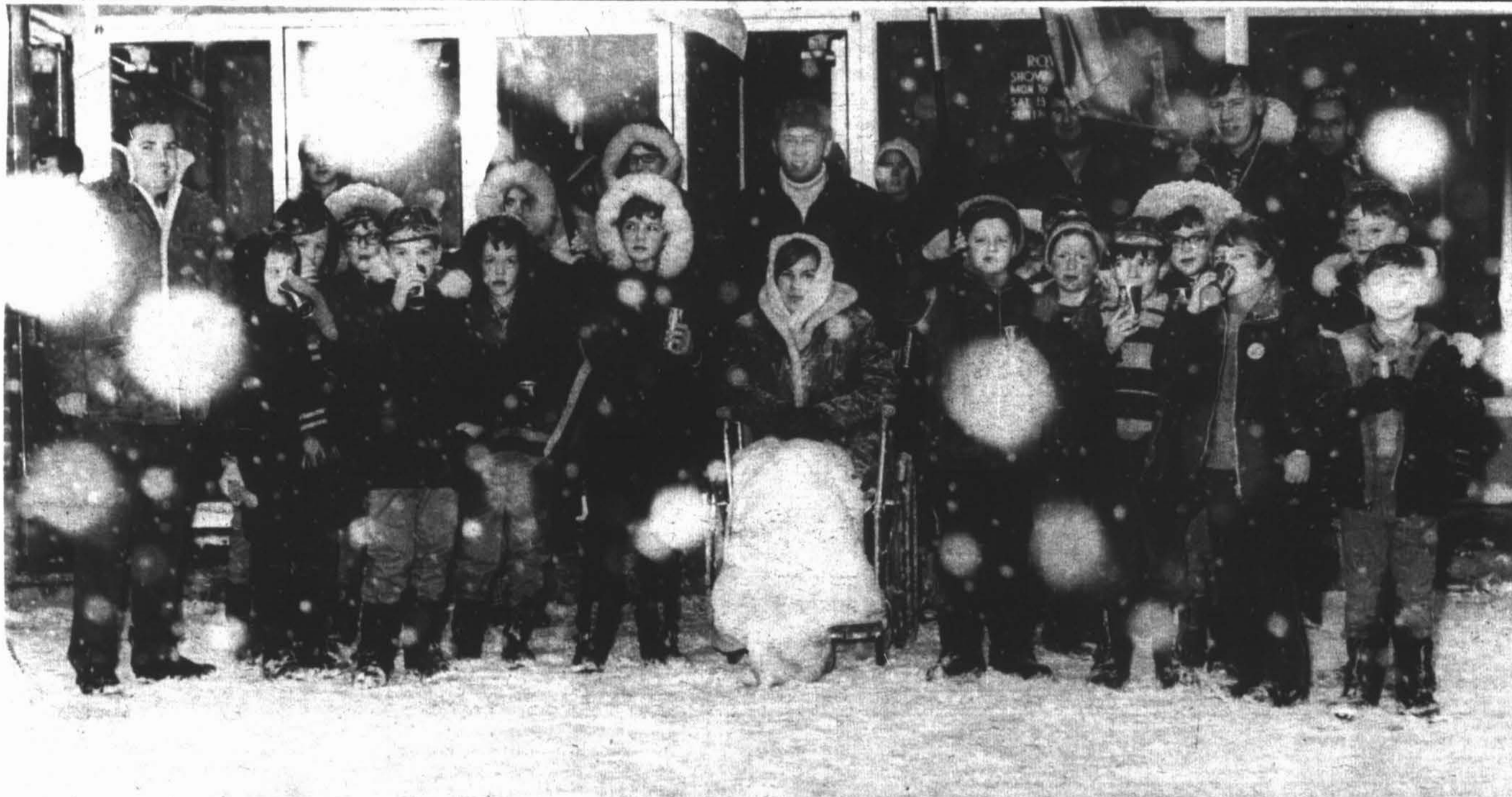
At the half-way mark in last month's Walkathon which raised approximately $7,500.00 for the Wabush Stadium Fund.