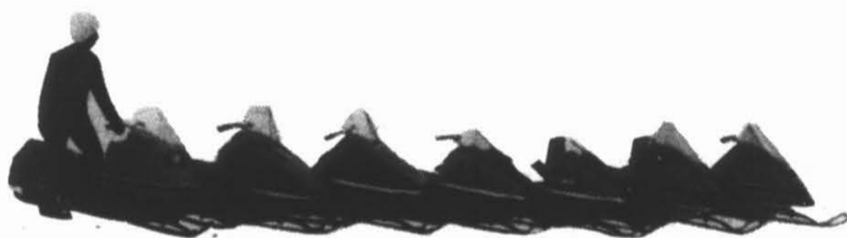
ELAN* • OLYMPIQUE • NORDIC* • T'NT* • BLIZZARD* • VALMONT* • ALPINE*