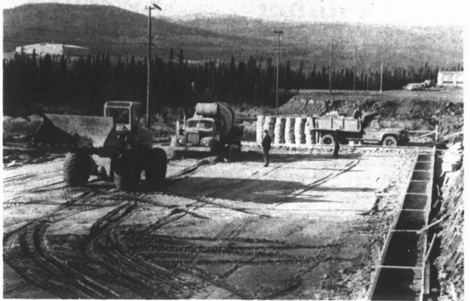
Rapid progress is being made on the construction of the Caro-Wabush Co-op Society building.