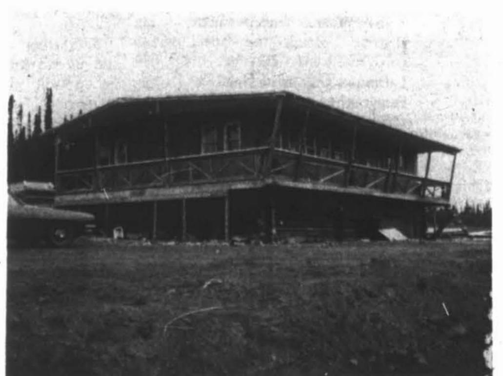
As the above photo shows, exterior work on the Tanya Sno Kart Club building is almost complete. Members and prospective members of the Club are advised that the General Meeting and the election of Club officers for the 1970-71 season will take place at the Wabush Legion at 8.00 p.m. on Thursday, November 12, 1970.