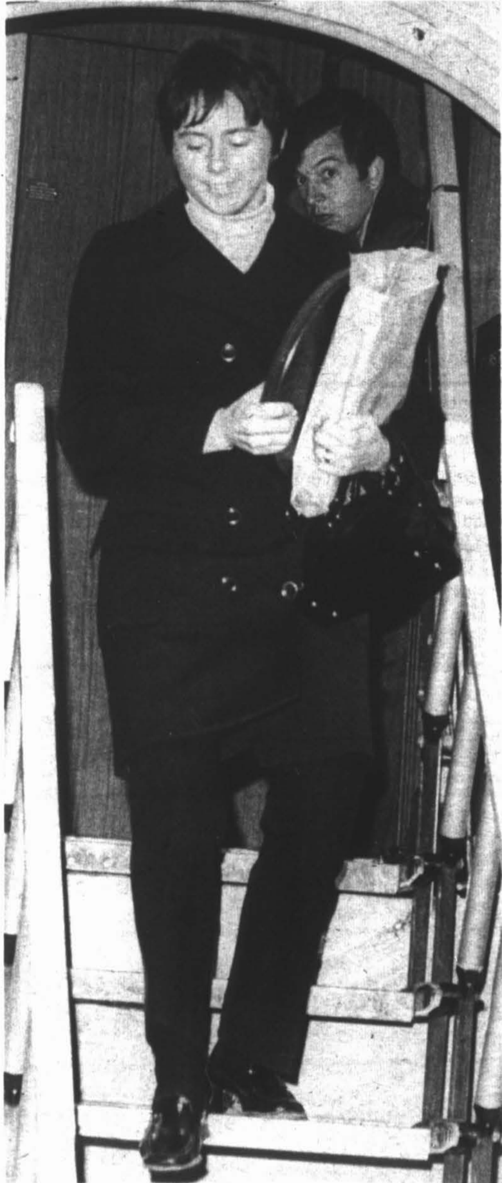
Former World Ski Champion arriving Wabush airport. Nancy Greene paid a visit to the area last week.